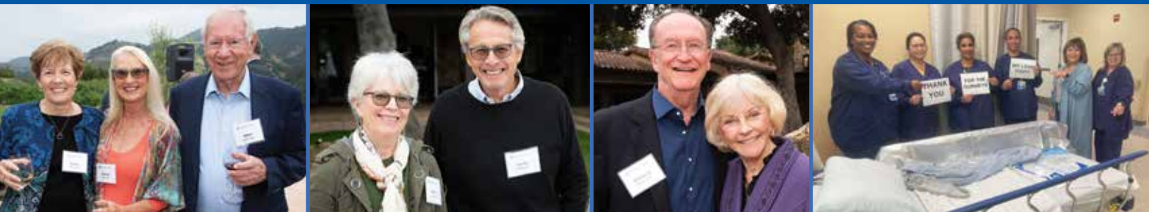
Left & Center: CEO Welcome Reception • Right: Gurneys purchased by generous major gift donors