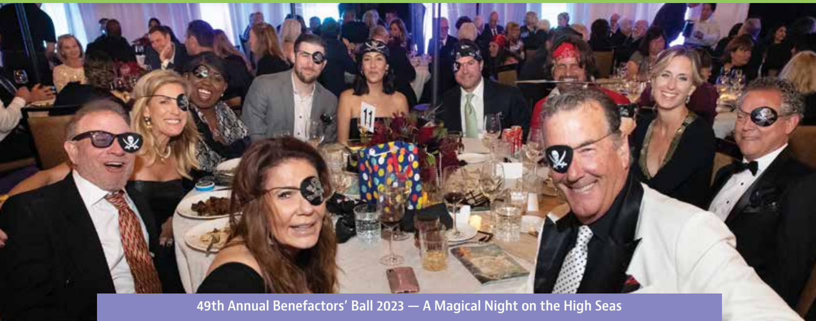
49th Annual Benefactors' Ball 2023 — A Magical Night on the High Seas